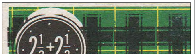
Offset top left denomination