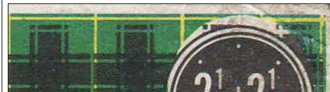
Offset top right denomination