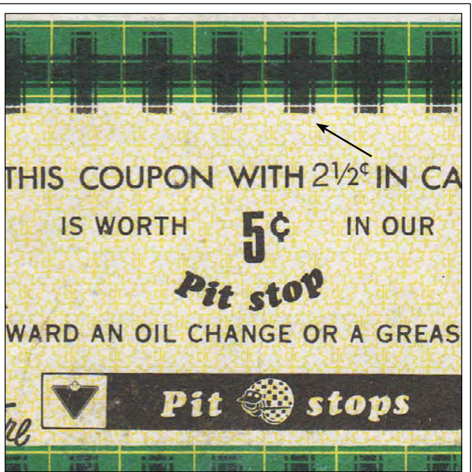
Offset low logo