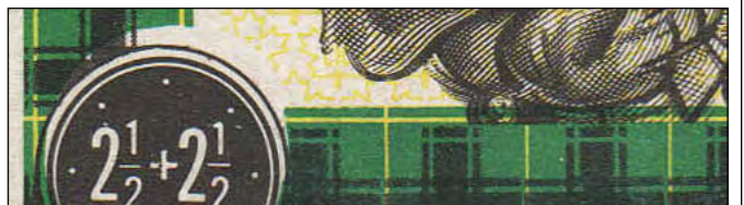
Offset bottom left denomination